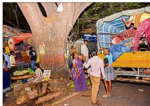
Vendors being evicted from the Sampige Road footpath in Malleswaram on Tuesday.

"It was a surprise drive where we could nab a lot of unauthorised parking of two and four-wheelers on the footpaths. Many petty shops and street vendors had encroached the footpaths. There were many drives conducted before