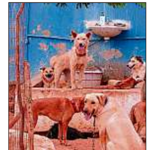
Canines at an animal shelter in Gottigere.

The trust releases street animals after treatment, but retains pets