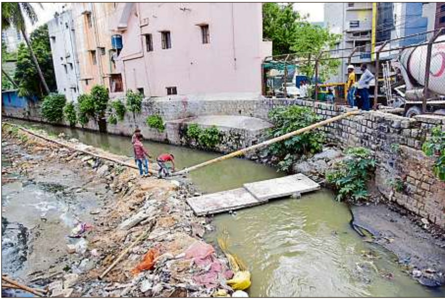
The company has to desilt and clear trash from stormwater drains besides ensuring that roads are not inundated.

The AMC is for 440 kilometres. Out of the 842 kilometres of stormwater drains it has in the city, the BBMP has done pucca retaining walls for 349 kilometres of drains. It also claims to have done one-time desilting in 184 kilometres of drains by March 31.